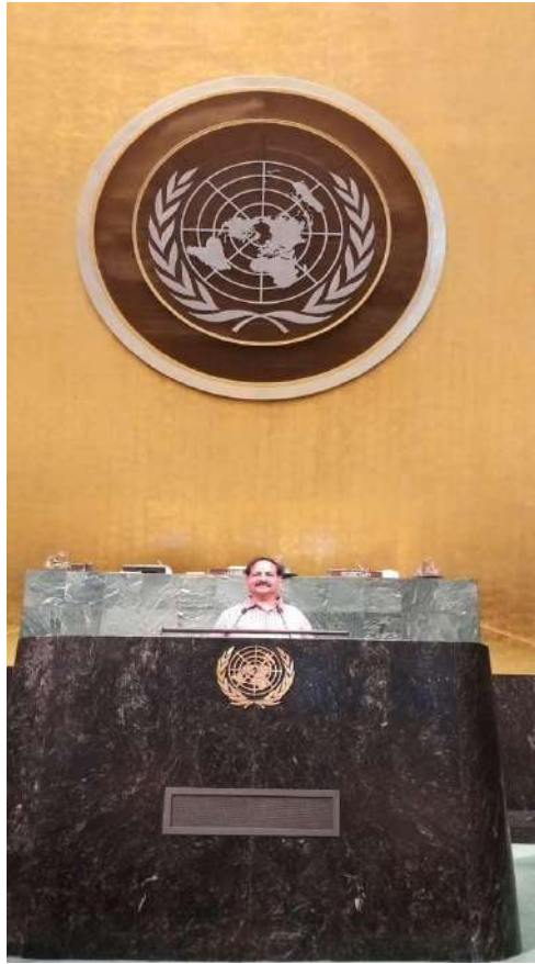
Participating a meeting held at United Nations General Assembly, June 2019