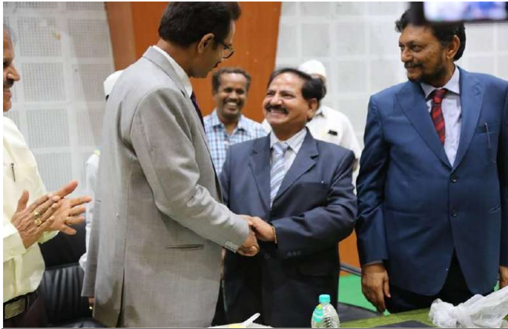
Inviting Justice S A Bobde, Senior Judge Supreme Court of India and Justice L Nageswara Rao, Judge Supreme Court of India to Law collegeon the occasion of Justice Chelameswar Endowment Lecture, 2018