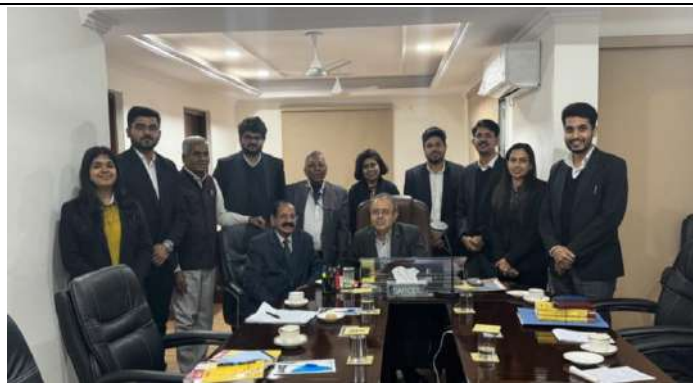
Vice Chancellor with the Law Commission of India, Chairperson and Members discussing Uniform Civil Code