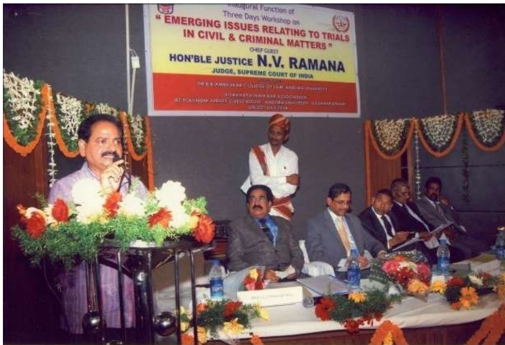
Presided the function where Alumnus of A.U. Law College