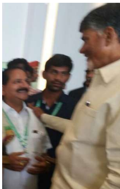
Being appreciated by Hon'ble Chief Minister of Andhra Pradesh, Sri. Nara Chandra Babu Naidu for effective participation of A.U. Law College in the National Green Tribunal Conference.