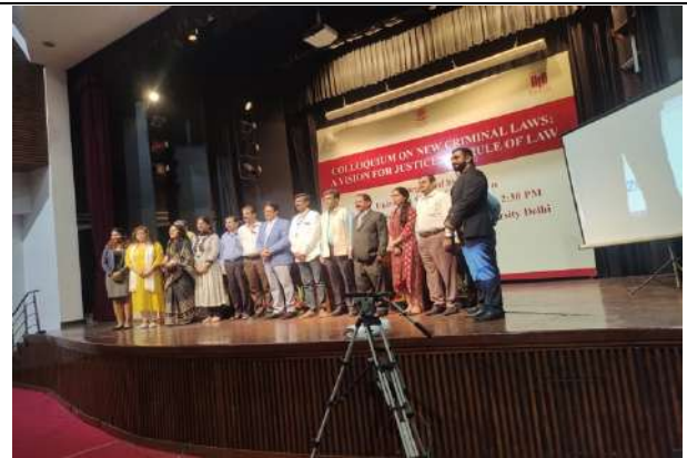
Speaking at UGC “Colloquium on New Criminal Laws: A vision for Justice and Rule of Law” at National Law University, Delhi