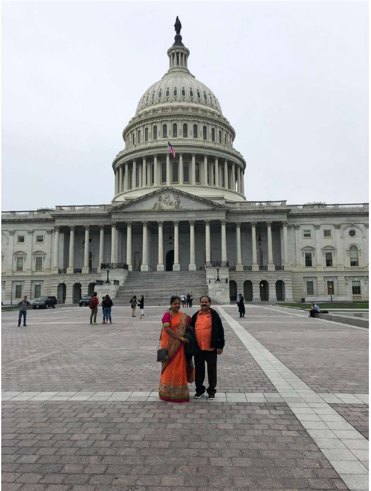
Visiting the US Capitol Building , May 2019