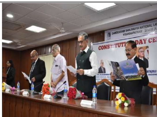
Constitution Day Celebrations – Hon'ble Sri Justice D.V.S.S.Somayajulu, Former Judge, High Court of Andhra Pradesh – Chief Guest