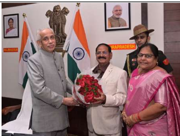
Vice-Chancellor with Hon'ble Sri S. Abdul Nazeer, Governor of Andhra Pradesh