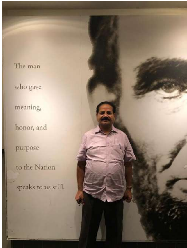
Recent Visit to Philadelphia and Washington DC ,USA May 2019