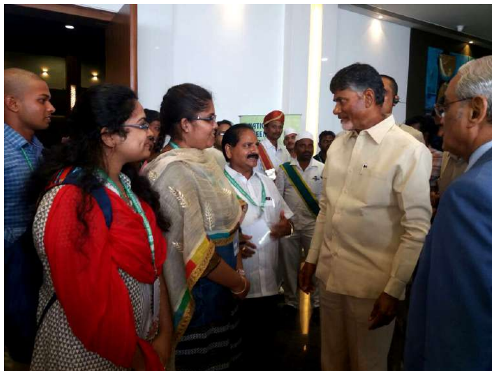
Interacting with Hon'ble Chief Minister of Andhra Pradesh Sri. Nara Chandra Babu Naidu along with Law College students in National Green Tribunal Regional Conference on 17 th September 2017. Justice Swatantra Kumar, Chairman – National Green Tribunal is also present.