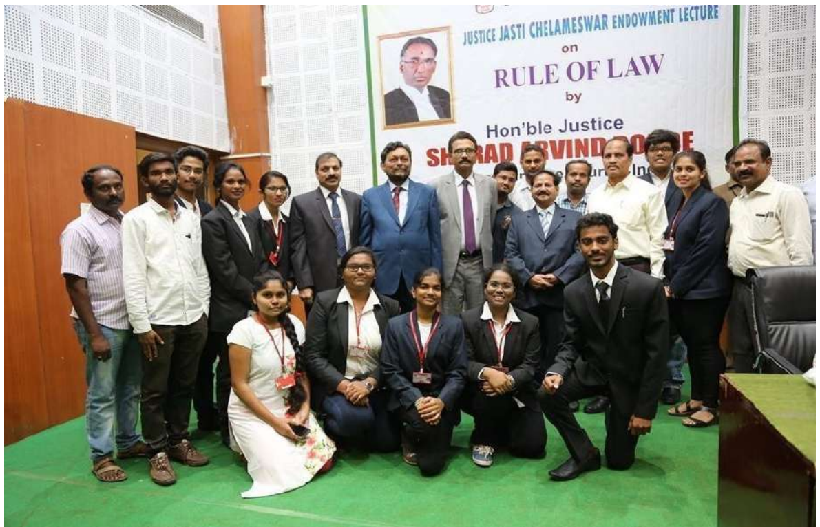
Justice Arvind Bobde (Senior Most Judge, Supreme Court of India) delivered Justice J. Chalameshwar Endowment Lecture on 17-03-2018 in Dr. B.R. Ambedkar College of Law, Andhra University.