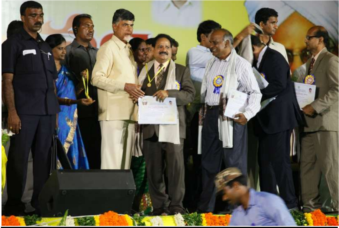
Best Teacher – 2015