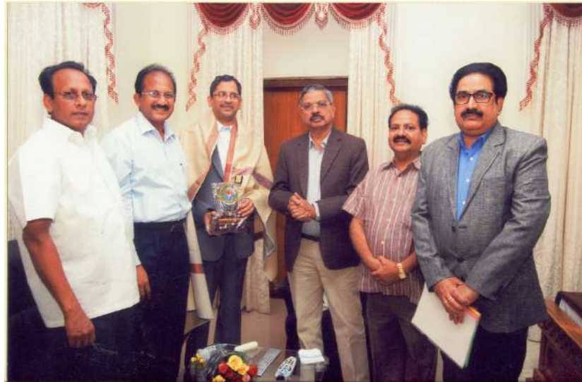
Honouring Hon. Justice, N.V.Ramana, Judge, Supreme Court of India, with Andhra University emblem in the presence of Hon. Chief Justice of India along with other University officials and Chairman, bar Council of Visakhapatnam, as Prinipal of Dr. B.R.Ambedkar College of Law, Andhra University at Visakhapatnam