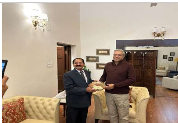
Vice-Chancellor with Hon'ble Sri Justice P. Sri Narasima, Judge, Supreme Court of India & Hon'ble Visitor, DSNLU