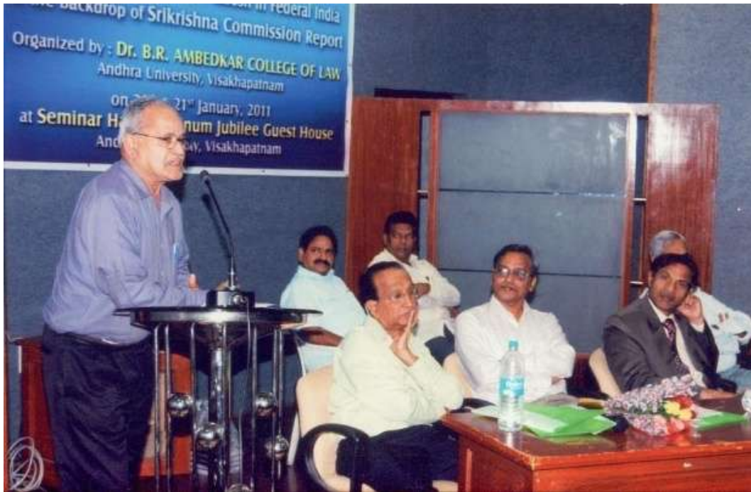
Organised UGC National Seminar on future of Andhra Pradesh in the backdrop of Justice Sri Krishna Commission report at Andhra University on 21-01-2011.