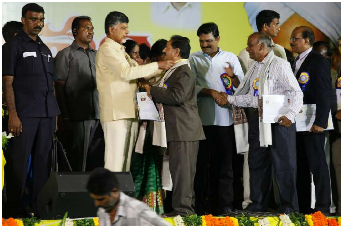
Receiving Best Teacher Gold Medal from Hon.Chief Minister of Andhra Pradesh, Sri. N.Chandra Babu Naidu on 05-09-2015. Sri. Ganta Srinivasa Rao, Minister for HRD is also present.