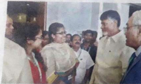
విద్యార్థులను అభినందిస్తున్న చంద్రబాబునాయుడు