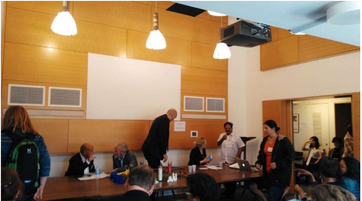
Participated in the International Seminar on "Indigenous Peoples" Rights Programme organized by Institute for the Study of Human Rights, Columbia University, New York. U.S.A. during 14th to 15th ,May 2016