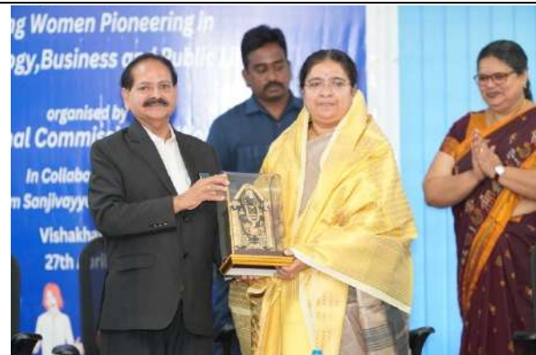
Vice Chancellor felicitating Hon’ble Smt. Justice Venkata Jyotirmai Pratapa, Judge, High Court of Andhra Pradesh who was Chief Guest in National Women Commission programme on Awareness and Women Capacity Building.