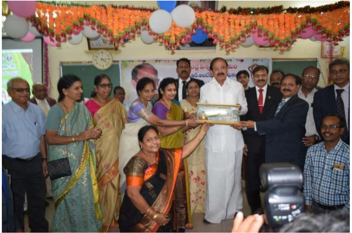
Felicitating Shri. M. Venkaiah Naidu, Honourable Vice President of India who is Illustrious Alumnus of A.U. Law College, Visakhapatnam.