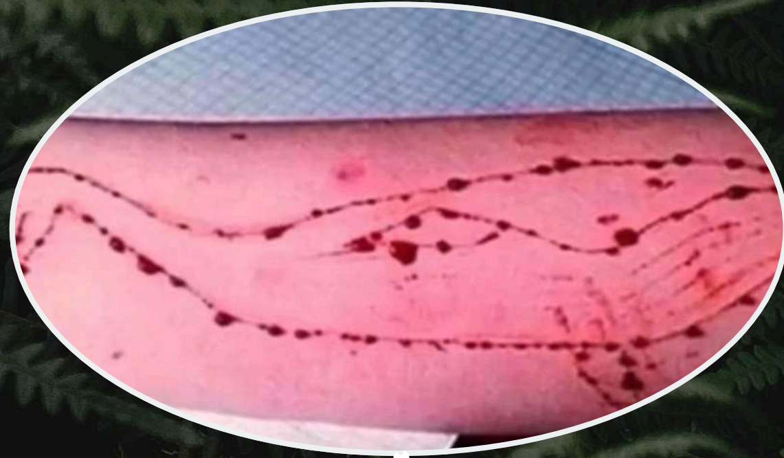
Condom Snorting Challenge CSI - 2.0