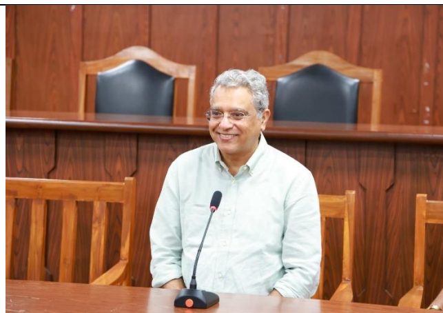
DSNLU CAMPUS VISIT by Hon'ble Justice Pamidighantam Sri Narasimha, Judge, Supreme Court of India & VISITOR - DSNLU