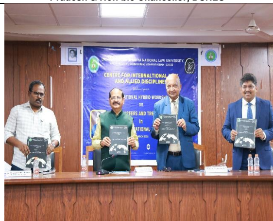
ONE DAY INTERNATIONAL WORKSHOP on CAREERS and TRENDS in INTERNATIONAL LAW by CILAD - DSNLU