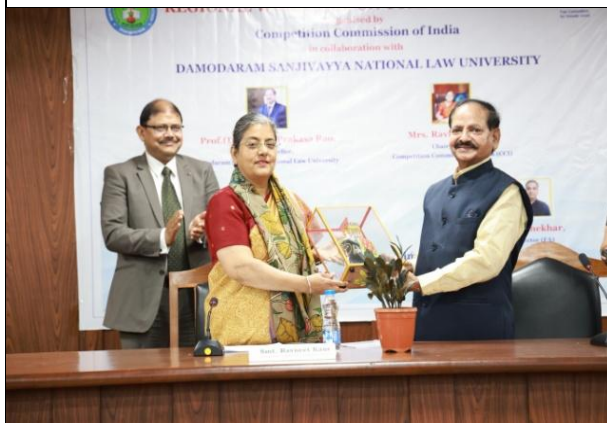
Regional Workshop on Competition Law, organized by the Competition Commission of India (CCI) in collaboration with the Centre for Competition and Antitrust Laws (CCAL), Damodaram Sanjivayya National Law University (DSNLU)