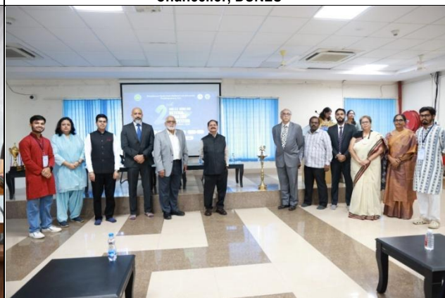
Damodaram Sanjivayya National Law University, 2nd Shri D.V. Subba Rao National Mediation Competition, 27th - 29th March 2026