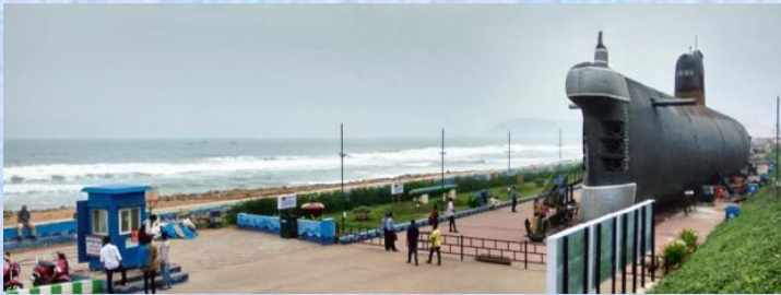
INS Kursura (S20)

Visakhapatnam is a port city and industrial center in the Indian state of Andhra Pradesh, on the Bay of Bengal. It's known for its many beaches, including Ramakrishna Beach, home to a preserved submarine at the Kursura Submarine Museum. The name was coined after Visakha, the Hindu god of valour. It is surrounded by Eastern Ghats and faces Bay of Bengal on the east. It is also called the City of Destiny, because of its landscaped view and very attractive beaches. It is the head quarters of Eastern Naval Command. Nearby are the elaborate Kali Temple and the Visakha Museum, an old Dutch bungalow housing local maritime and historical exhibits. Kailasgiri park was developed by the Visakhapatnam Metropolitan Region Development Authority and comprises 380 acres of land covered with flora and tropical trees. The hill, at 173 metres, overlooks the city of Visakhapatnam. Other tourist spots: Simhachalam, Thotlakonda beach, Rishikonda beach, Visakhapatnam Port.